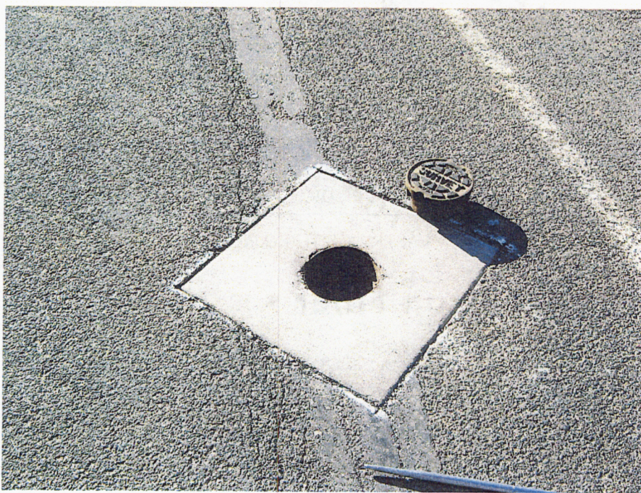
Figure 1 - Monument box set in Airport Parkway.

Set a 3/4" dia. iron pipe, 3' long, with a 3" dia. brass cap, 6" below the street surface, in a 6" dia. cast iron street box with SURVEY lid for the reestablished corner position.