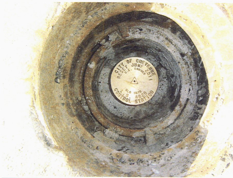
Figure 2 - Brass Cap set in street box.